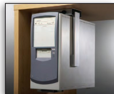
CPU-87 with fixed metal bracket (SP/CPU-87)