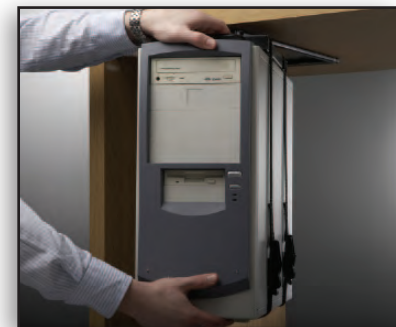
CPU-72 sliding & rotating bracket (SP/CPU-72)