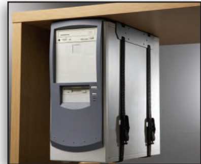
CPU-42 with fixed bracket & strap (SP/CPU-42)