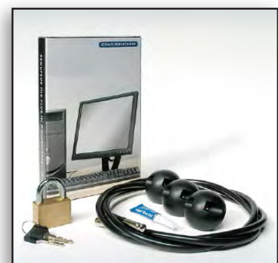
SecuKit III proLine Black (SP/51733/KD)