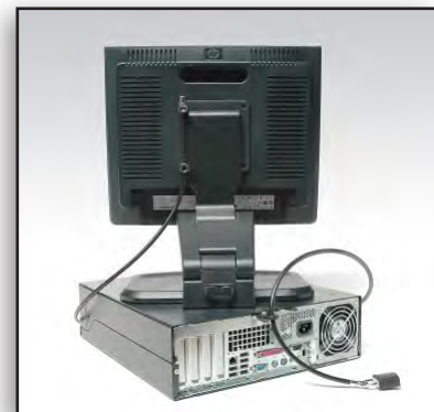
PCKit II SaveLine (SP/17502/KD)