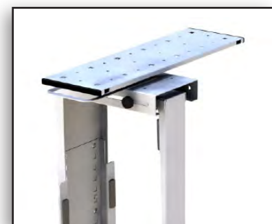
1220B Swivel/Slide Track for CPU-87 (SP/EX-1220B)