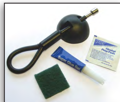
Secure Point with adhesive (SP/DSP2)