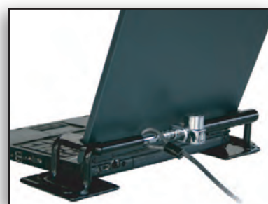
Benji I in open position (SP/Benji I)