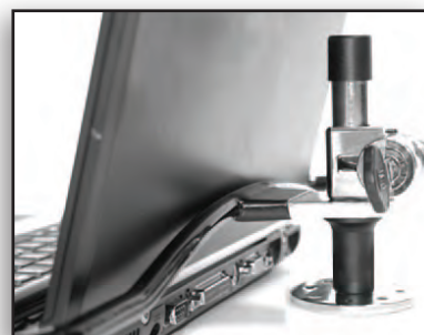
R8620 15" (SP/R8620-15)