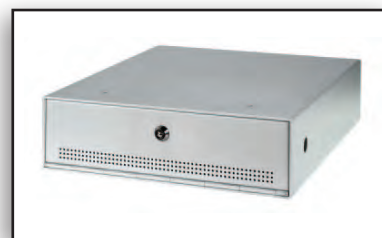
Solo Closed Door (SP/SOLO)