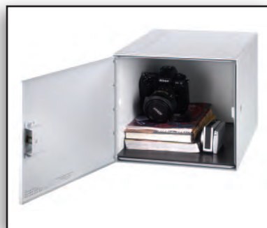
Solo Plus Open Door (SP/SOLOP)