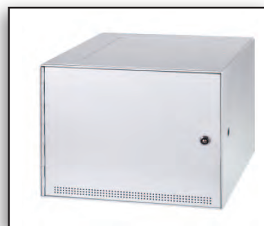
Solo Plus Closed Door (SP/SOLOP)