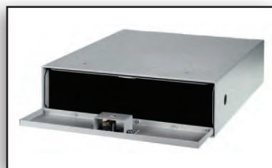
Solo Open Door (SP/SOLO)