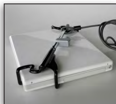
Spyder 10 in closed position (SP/SPYDER10)