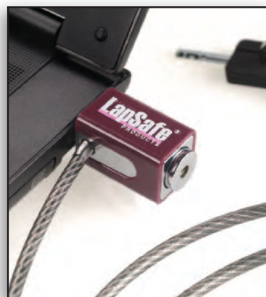
Premium Security Cable (SP/PLSC/KD)