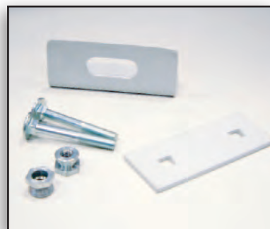
Secure Point with bolts (SP/DSP1)