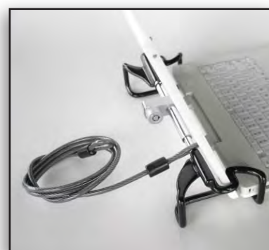
Spyder 10 in open position (SP/SPYDER10)