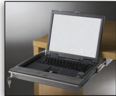
Vented Laptop Drawer (SP/EX-EX6101V)