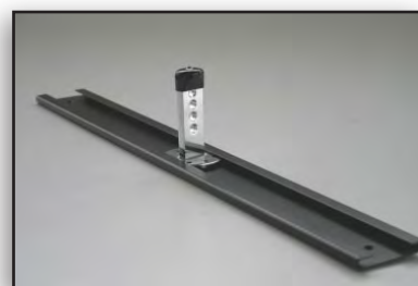
Laptop Lockdown Track (SP/Track1.2)